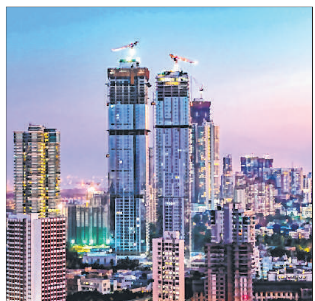
Average flat size has risen to 1,150 sq. ft. in 2020 from 1,050 sq. ft. in 2019

preferences amidst the backdrop of COVID-19 in 2020 first halted, then reversed the 'honey, I shrunk the flat' effect. The average apartment size is still highest in Hyderabad at 1,750 sq. ft. amongst the top cities - approximately twice that in MMR where, at 932 sq. ft., the average apartment size continues to be the lowest. MMR, nevertheless, saw the maximum rise of 21% - from 773 sq. ft. in 2019 to 932 sq. ft. in 2020. Pune came next with a 12% annual increase in the average apartment size - from 878 sq. ft. in 2019 to 986 sq. ft. in 2020.