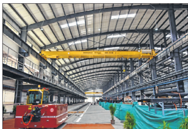
Interested agencies will have to make an earnest money deposit of about Rs 5.96 lakh

The Mumbai Metropolitan Region Development Authority (MMRDA), the nodal agency for building 300 km of vast Metro network, has proposed a plan to build an elevated depot for three Metro lines: 4 (Wadala-Thane-Kasarva-davali), 4A (Kasarvadavali-Gaimukh), 10 (Gaimukh-Shivaji Nagar) and 11 (Wadala-General Post Office, CSMT) at one stop. This depot is proposed at Mogharpada, Thane.